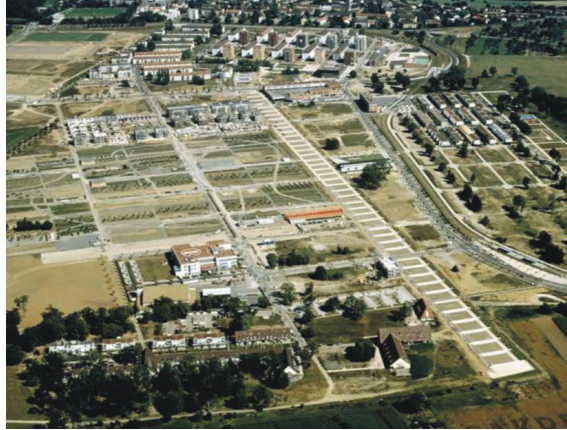
Figure 1: Residential area Scharnhäuser Park

The geo-information is one of the aspects of this project, which will be discussed in brief in the following sections.