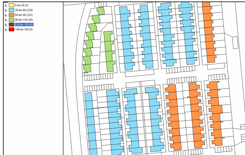
Figure 3: Thematic map for average annual heating energy consumption (2005)

The visualization and interpretation of the energy consumption data within the GeoMedia Workspace show significant differences between the values of the energy consumption of buildings within one building type. Changing the users behavior could help to achieve a significant reduction of the building energy consumption.